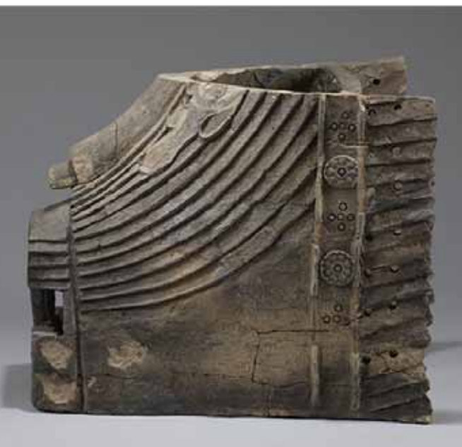
The bottom end of an ancient roof tile is unearthed at the northern end of the seungbang building at the site of Wangheungsaji temple in Buyeo, Chungcheongnam-do Province.

been able to recreate a 3-D image of a connected roof tile standing 123-centimeters tall and 74-centimeters wide. The tile is decorated with carvings of lotus flowers, cloud patterns and other motifs taken from nature. The top of the tile is said to curve upward like the tail of a bird about to take flight.