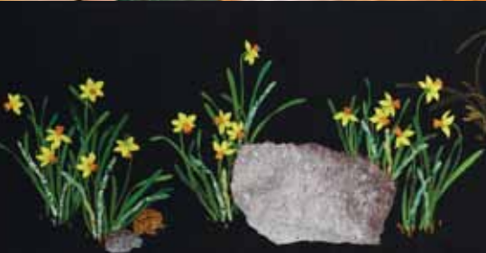
A Snapshot of 2016