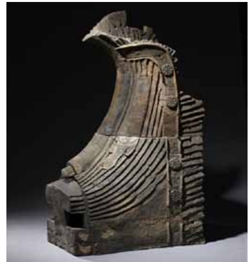
Researchers assembled 3-D models of the top and bottom halves of the roof tiles found at the Wangheungsaji Buddhist temple.