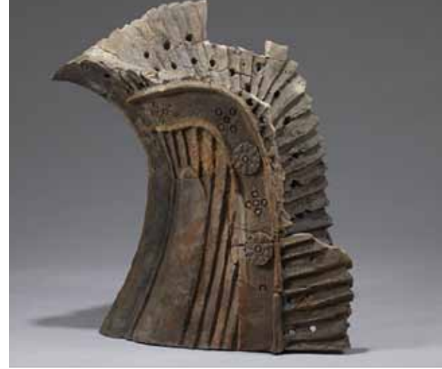
The top end of an ancient roof tile is unearthed at the southern end of the seungbang building at the site of Wangheungsaji, a Baekje Buddhist temple in Buyeo, Chungcheongnam-do Province.

Archeologists believe that the tiles fell off the roof and got damaged on the ground. Only the top half of the tile was discovered at the southern end, while only the bottom half was retrieved at the northern end. By combining the two halves, researchers have