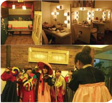
The experience programme provided at the Hanbok Cafe Studios includes hair and make-up services and is very popular with young people.

The opportunity to try out the hanbok is offered from the time one enters Korea! Incheon International Airport has a wonderful collection of Hanbok , from daily wear for the common people during the Joseon Dynasty, luxurious outfits for the gisaeng (the Korean version of geishas ), to the royal costume of the king and queen. This free event delights immigrants who try on the traditional Korean outfits and pose like kings and queens in the photo zone.