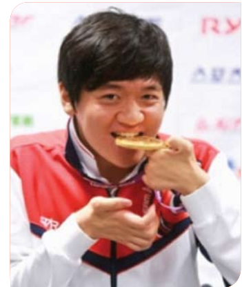
Swimmer Min Byeong-eon (in the picture above), earned Korea its first gold medals in Paralympic swimming in 24 years (Photo courtesy the Korea Sport Association for the Disabled).