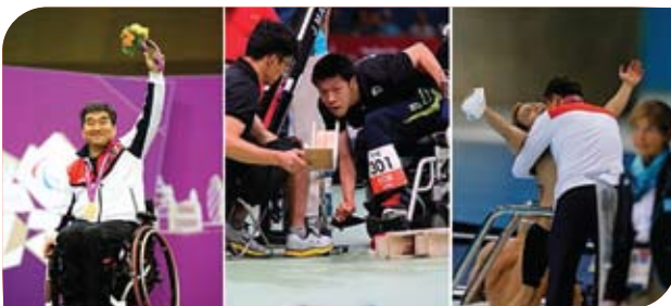
Among the Korean athletes who shone at the 2012 London Paralympics were (from left to right) double gold medalist shooter Park Sea-kyun, boccia silver medalist Jeong Ho-won, and swimming gold medalist Lim Woo-geun.